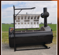
Model 529 w/Model 12 After Burner & Optional Load Winch